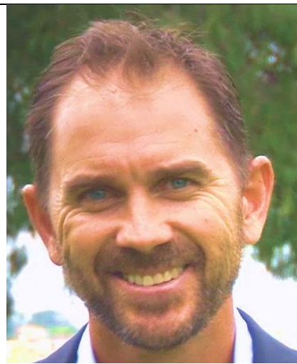
Justin Langer is a huge supporter